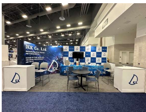
△Our booth image

When you visit, be sure to visit our booth.