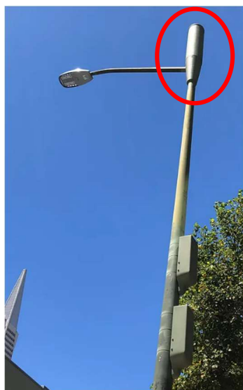
△ Multi-Band Small Cell Antenna (on street pole)