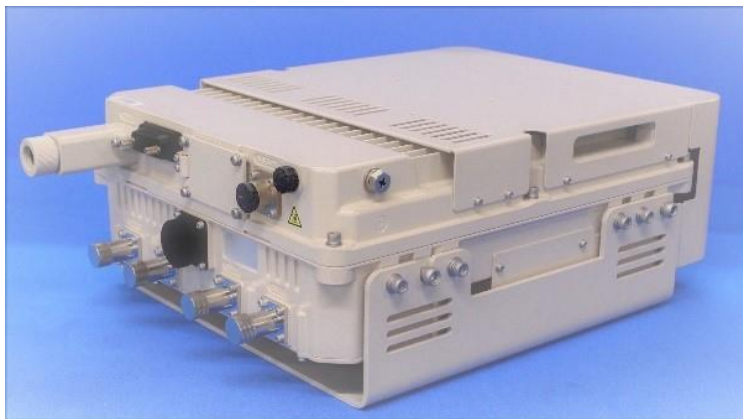
O-RAN Radio Unit