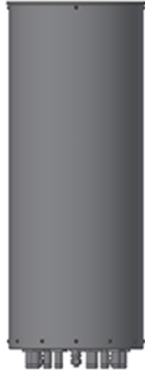
Small Cell Antenna